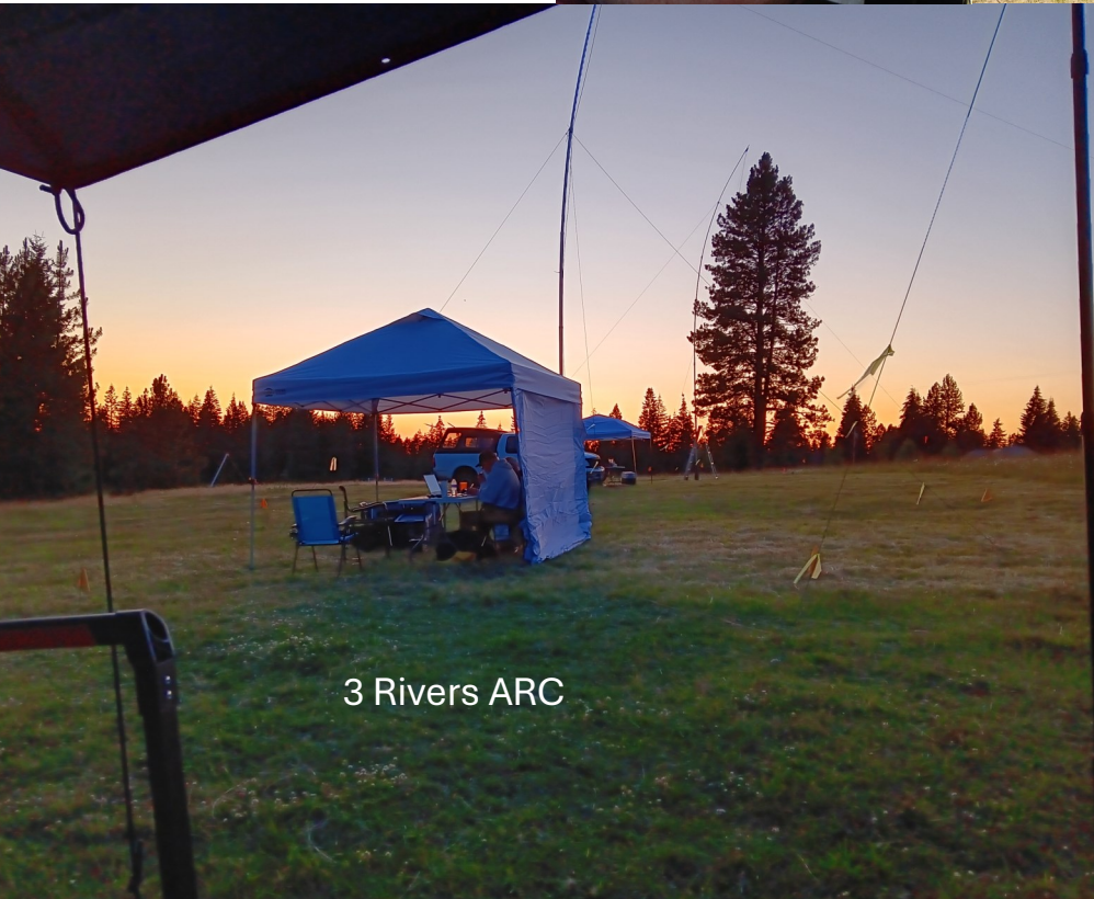
3 Rivers ARC